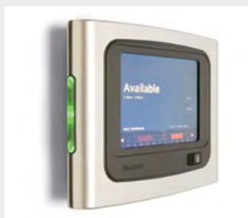
Lights Indicate Room Availability