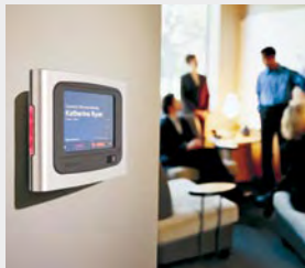
Captures Room Occupancy